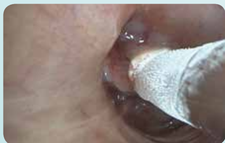
Cryobiopsy with high diagnostic weighting In comparison with a forceps biopsy, biopsy samples taken using cryosurgical techniques are considerably larger and do not contain artifacts.