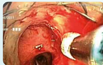
Cryodevitalization For ablation of tissue structures.