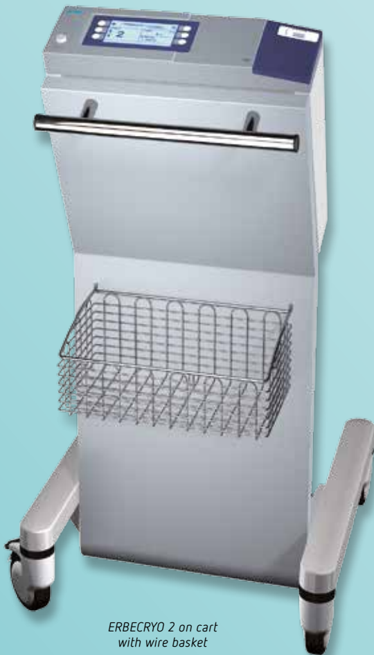
ERBECRYO 2 on cart with wire basket

With cryorecanalization, exophytic stenoses, foreign bodies and blood clots are immediately removed, and the patient can breathe again freely as soon as the procedure is over.