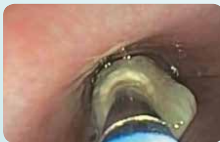
Cryorecanalization The stenosis tissue is frozen and extracted using cryosurgical techniques.