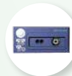
2Pin-22-28-8/4 mm, bipolar No. 20140-613