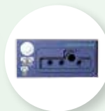
3Pin-Bovie, monopolar No. 20140-622