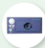
2Pin patient plate No. 20140-641