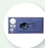
6 mm-2Pin patient plate No. 20140-642