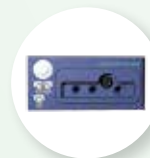
3Pin-9/5 mm, monopolar No. 20140-623