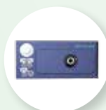
8/4 mm, bipolar No. 20140-610