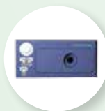
6 mm patient plate No. 20140-640