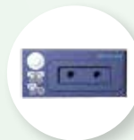
2Pin-22 mm, bipolar No. 20140-612