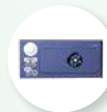
Multifunction No. 20140-630 (VIO 300 D only)