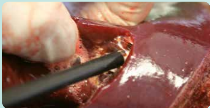
Electrosurgery and hydrosurgery integrated in one instrument (e.g. for liver surgery)