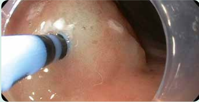
Elevation of the mucosa before endoscopic submucosal dissection (ESD)