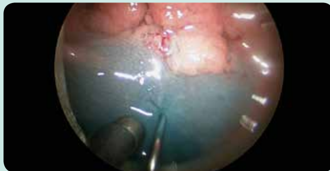
For TEM, the resection plane is raised by submucosal elevation