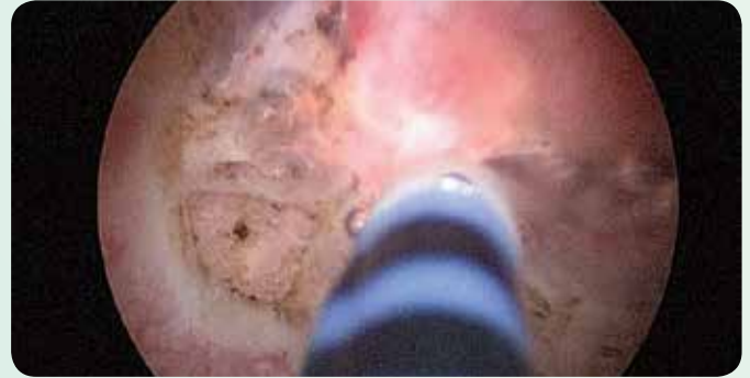
Elevation before resection of the bladder tumor