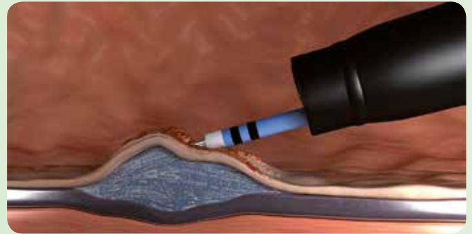
Fig 2: Elevation:

The waterjet function of the applicator reveals vessels which may be selectively coagulated using electrosurgery (example: liver surgery).